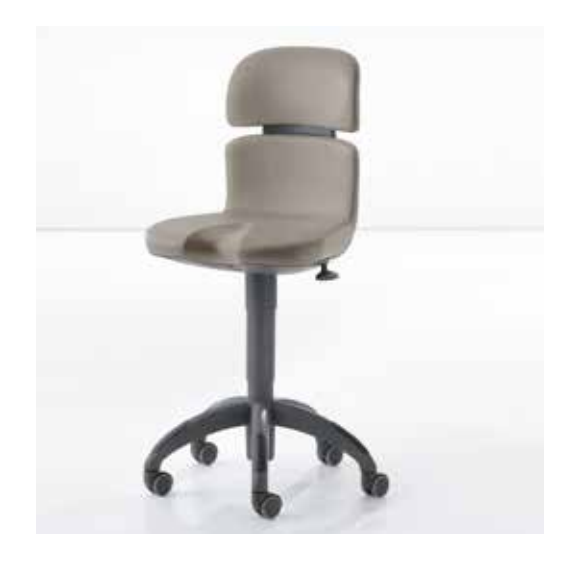
Hugo Manual Manual height adjustment