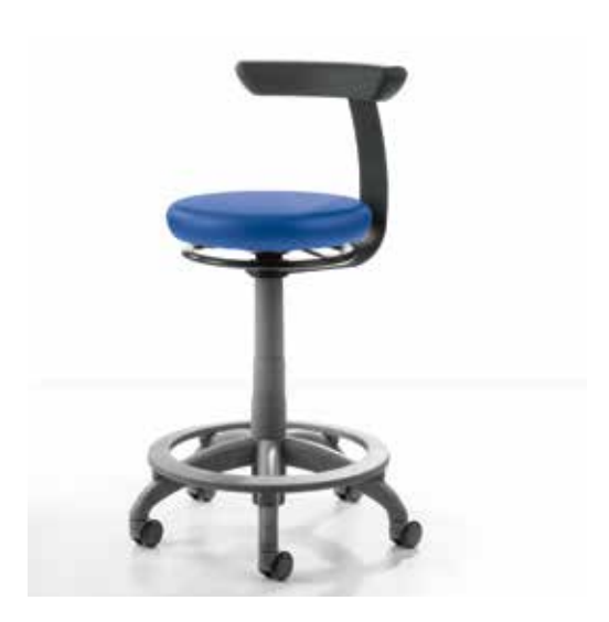
Carl Manual Plus Manual height adjustment, with foot ring