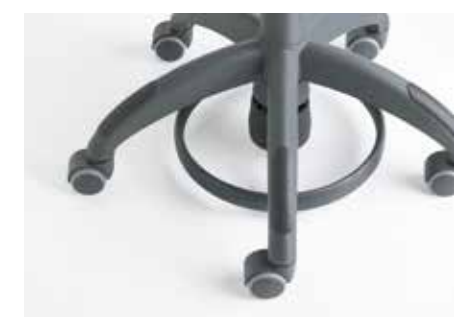
The stool base - for more flexibility

The innovative OptiMotion mechanism with flexible tilt of the front of the left or right half of the seat ensures more freedom of movement to allow you optimal access to the patient. This simultaneously reduces pressure points on the thighs considerably. The new thermo upholstery provides increased comfort during prolonged treatment sessions.