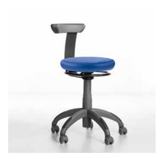
Carl Manual Manual height adjustment