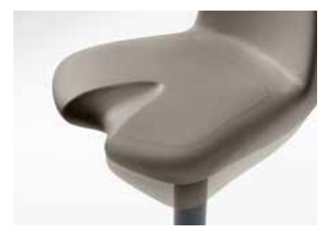
The seat - for more comfort

The dynamic Hugo backrest gives you more flexibility during treatment. The backrest follows your movements and provides support - while you work and when you relax. Your spine is automatically straightened, effectively preventing muscle strain.