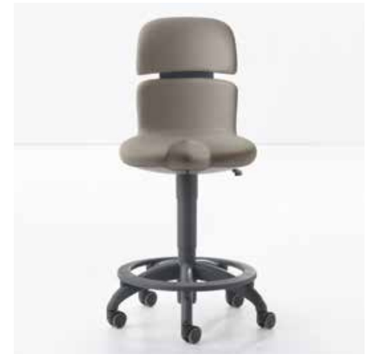
Hugo Manual Plus Manual height adjustment, with foot ring