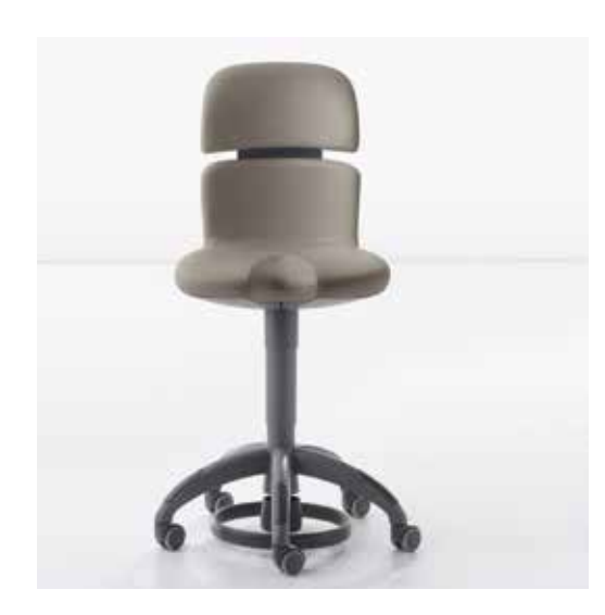
Hugo Freehand Height adjustment by foot pressure