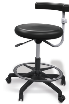
Performer eVo assistant's stool