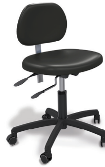
Performer eVo doctor's stool

Iconic durability with contoured support. An anatomically shaped backrest, adjustable torso support, rolled seat edges and ergonomic tilt help reduce disc pressure and muscle pain.