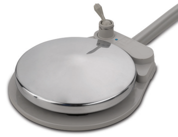
Disc foot control

Effortless control, your way. Choose from a disc control or a lever-style control for precise modulation of electric and pneumatic handpieces..