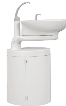
Cuspidor and support centre

The optional porcelain cuspidor swivels for easy patient access and includes a two-litre bottle for ample water supply. Support centre stores amalgam separators, vacuum systems or other ancillaries.