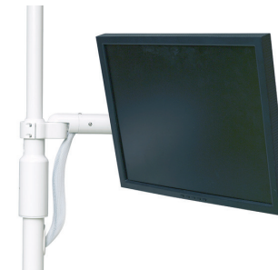
Monitor mount with arm

The optional monitor mount positions conveniently over the patient for consultation and education, and tucks neatly out of the way when not in use.