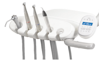
A-dec 336 Traditional

Compact and easy to position to keep everything you need within natural reach.