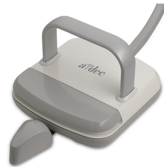
Lever foot control